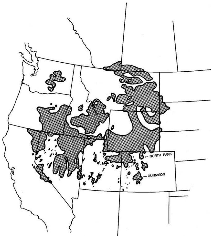
FIG. 1. Current distribution of Sage Grouse in North America (Western States Sage Grouse Comm. 1985:19).

among-year variation of morphological features of adult males. We used analysis of variance (ANOVA) to test for differences between early and late periods of courtship (nested within years and populations) for those years (1984–1985) in which birds were collected in the two time periods. Data from different collection periods were pooled within years when analyses indicated no differences. A second ANOVA assessed differences among years (1984–1986, nested within populations) and between populations.